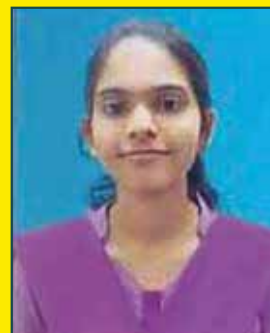
Samsheera Arts 96%